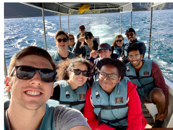
Photos: Collage of colorful doors in old San Juan, Puerto Rico, Summer study abroad group selfie in Quito (2019)

information on L5-level summer courses abroad, as well as semester or full-year abroad programs, contact the Center for International and Professional Experience, or consult the DUS.